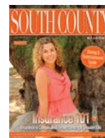
South County Magazine (est 2011)