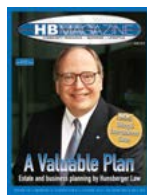
HB Magazine (est 2003)

Marmalade™ is brought to you by COMMUNITY PUBLICATIONS , publishers of these Orange County magazines: