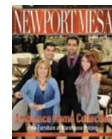
Newport Mesa Magazine (est 2012)