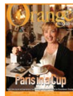
Orange Magazine (est 2007)